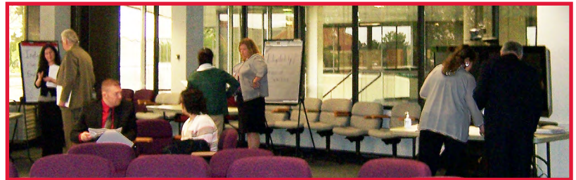
Consumer for a Day - RSC Commissioners experience the BVR counseling process.

RSC commissioners held a two day retreat at headquarters that featured each of them playing the role of a typical consumer of the Bureau of Vocational Rehabilitation (BVR), the Bureau of Services for the Visually Impaired (BSVI) and the Division of Disability Determination (DDD) services. Each commissioner drew different scenarios, representative of the different types of disabilities, age ranges and employment goals RSC consumers bring to the counseling process as well as an understanding of what a claimant goes through after applying for Social Security.