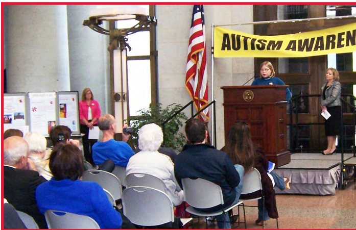
Autism Awareness event at the Ohio Statehouse

was proud to describe our efforts to expand the school to work transition through programs that now touch every corner of the state with a combination of school work and multiple internships on the grounds of major employers. Thanks to our strong relationships with many of these employers, through the Ohio Business Leadership Network, we have detailed knowledge of the success they are having helping us to build a bridge from Individual Education Plan (IEP) to Individual Plan for Employment (IPE). The Autism Awareness Day crowd left with high hopes for the future thanks in part to the knowledge that RSC is a partner in programs that have introduced lean process improvements, and our partners have seen major productivity improvements for their entire operation as a result. There is no better feeling than telling parents seeking help, about employers quickly adding ten times more RSC consumers to their workforce than originally expected because of this productivity boost.