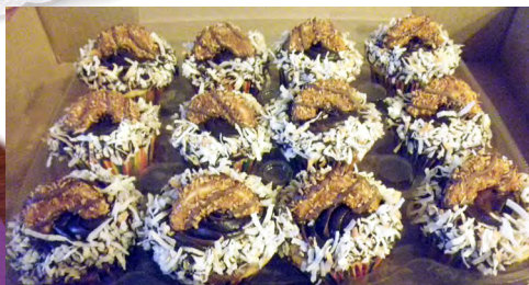
The "Girl Scout" box at left was a creation of one of the contestants who made the Somoas cupcakes above.