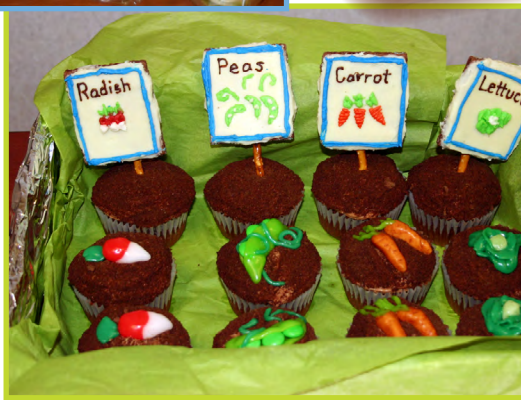
Above: Garden Party, the winning cake/ cupcake entry.