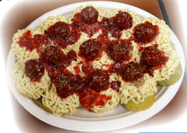
Anyone for some spaghetti?