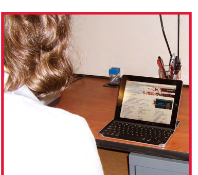
Ipad tablet like those donated to OSSB from the Kiwanis Club of Columbus

gift of iPads and invited Kiwanis members to become involved in OSSB's mentoring program by offering job shadowing and internship opportunities, I realized what a great foundation the club has already laid toward independence and employment.