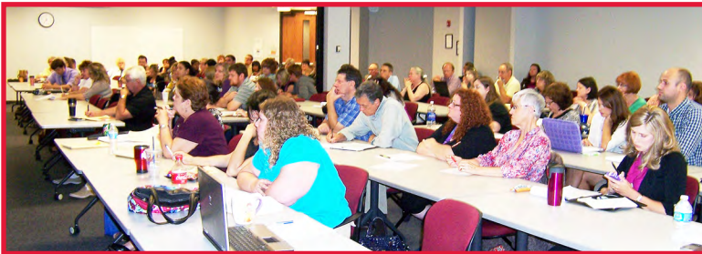
Attendees of the VRP3 Mentoring Meeting

As the previous stories make clear, partnerships are in the DNA of the new RSC business model; and our Vocational Rehabilitation Public & Private Partnerships (VRP3) program has built a strong support system