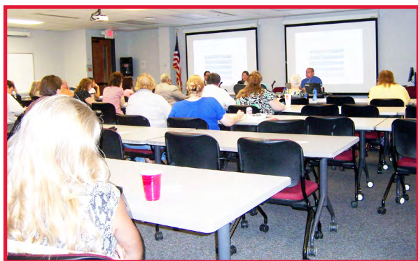
Participants at the Fee Schedule Meeting

Ohio is currently the only VR program in the nation paying rates set by providers. This had been an issue raised in past federal Rehabilitation Services Administration (RSA) audits, and PCG noted that difficulty in establishing quality control and administrative oversight because of the 4,154 different fee combinations for the 29 services provided.