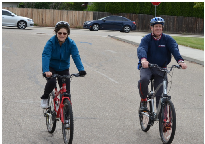
Returning from ride.