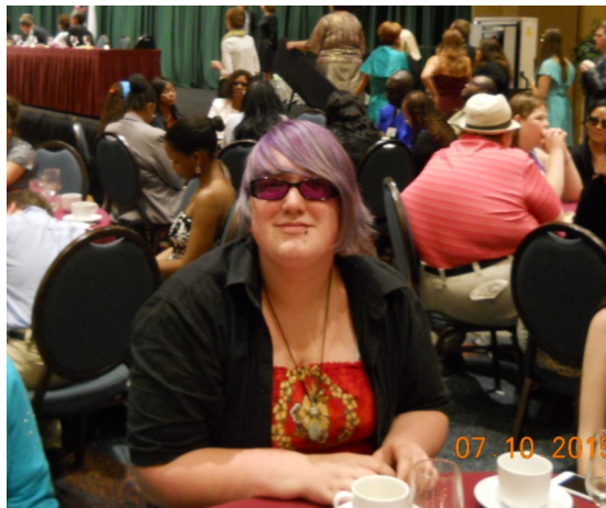
College students at NFB Convention, Orlando , FL, 2015