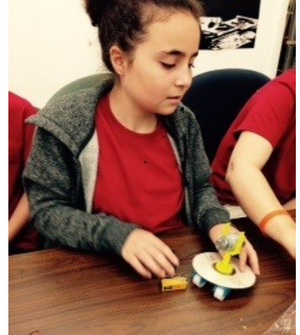
Braille Enrichment for Learning and Literacy, BELL, Summer Day Camp for visually impaired children.