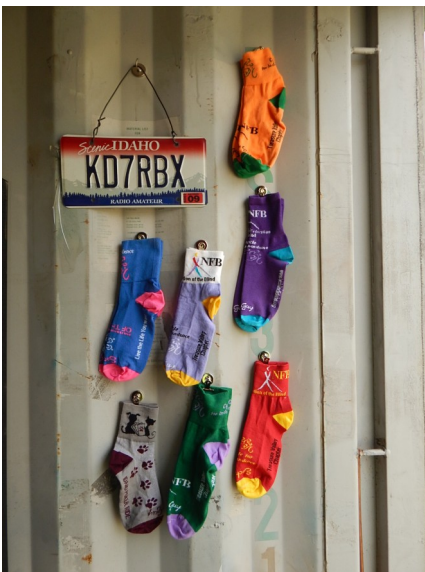
Seven years of socks