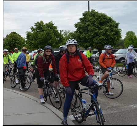
Ready to take off