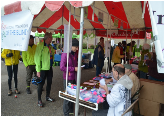
Riders checking in