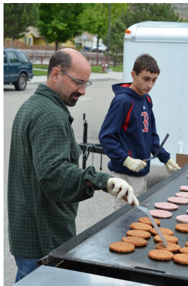
Lions cooking lunch