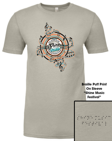
Braille Puff Print On Sleeve "Shine Music Festival"