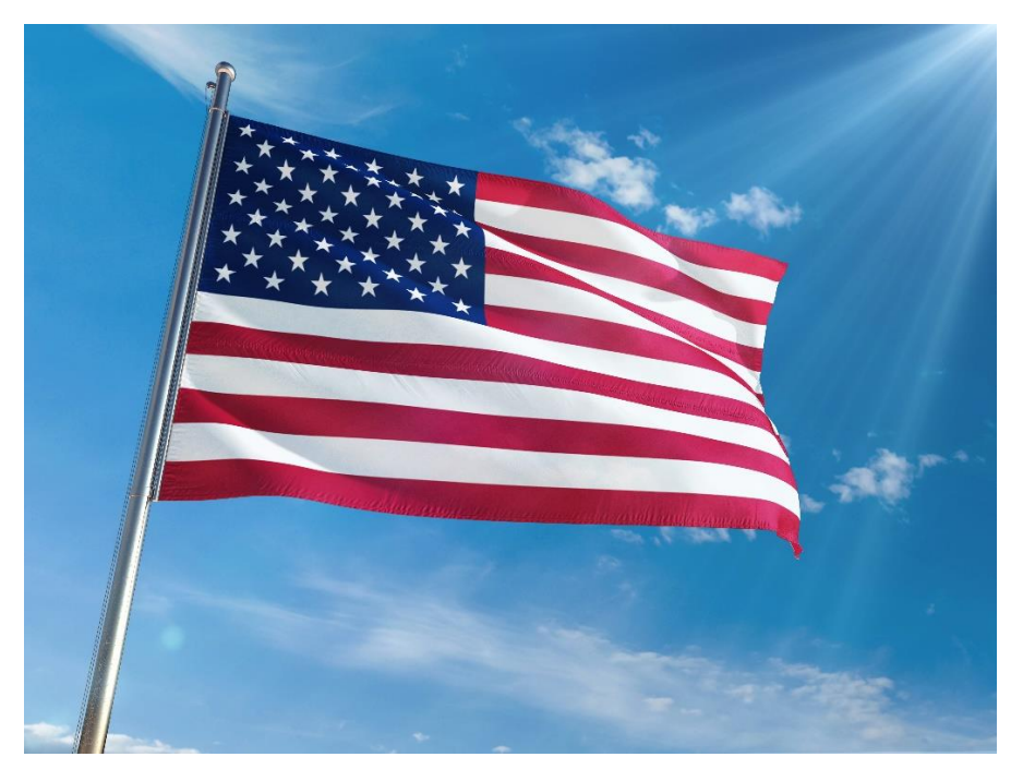
Image description: American flag, flying on a flagpole, waving in a slight breeze against a bright blue sky with a few wispy white clouds.

Friday, November 12 to Sunday, November 14