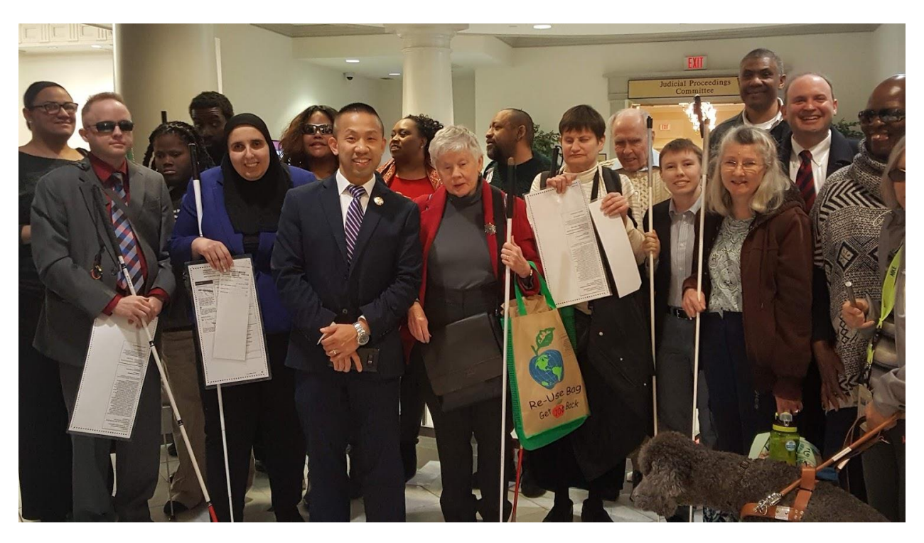
Image: NFBMD engaged in legislative advocacy in Annapolis with Senator Clarence Lam fighting for desegregated voting based on disability