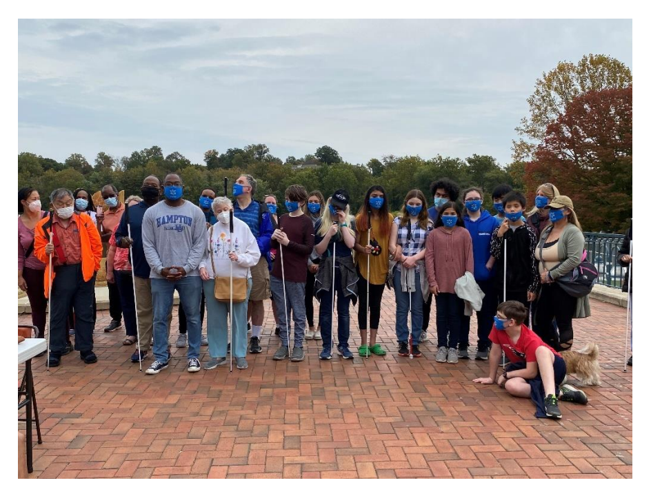
Image: Participants of the Central Maryland Chapter receive a White Cane Awareness Day proclamation from Howard County Councilperson Opel Jones.

Image: Participants dressed in costume for the NFB Blind Equality Achievement Month Wizarding Weekend on Main in Old Ellicott City