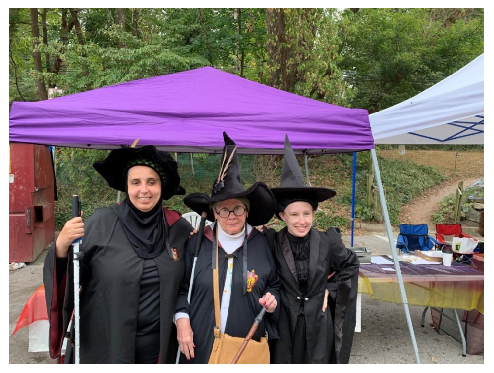
Image: Participants dressed in costume for the NFB Blind Equality Achievement Month Wizarding Weekend on Main in Old Ellicott City