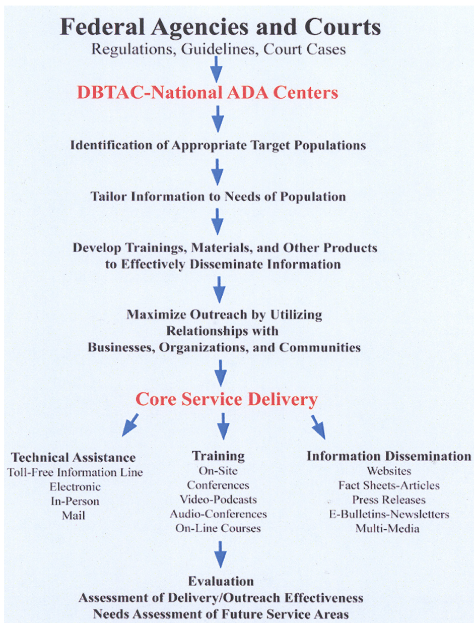
DBTAC-ADA NATIONAL NETWORK SERVICE DELIVERY MODEL CHART