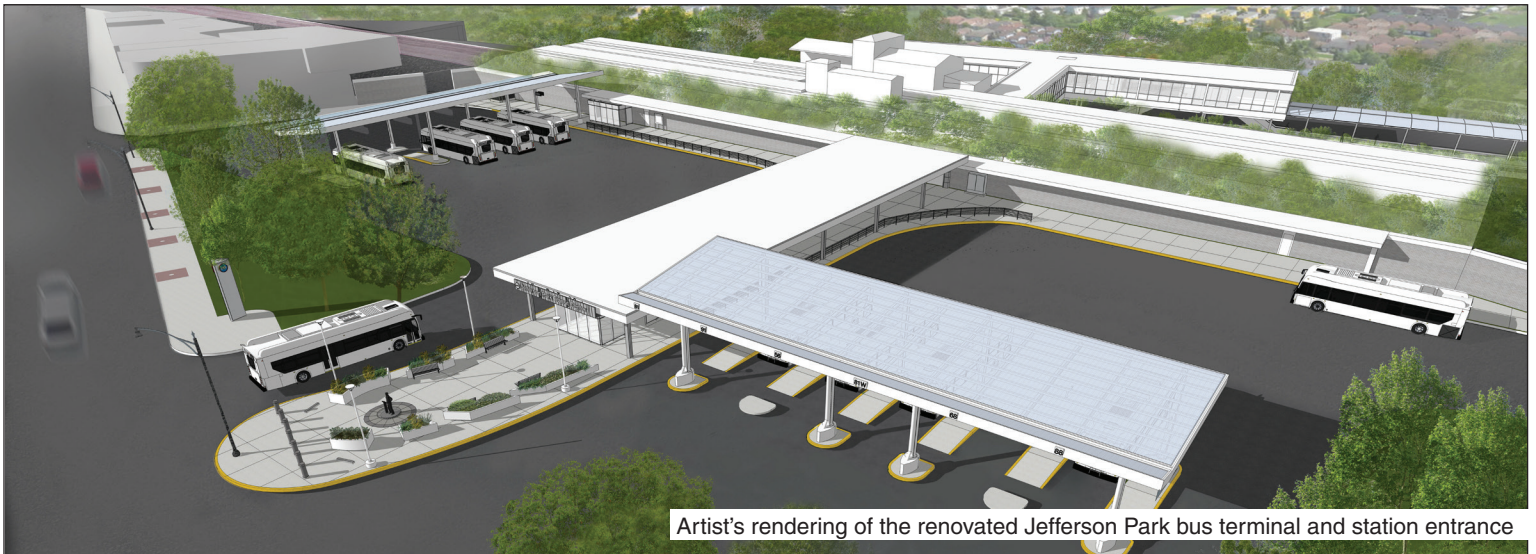
Artist's rendering of the renovated Jefferson Park bus terminal and station entrance

Mayor Emanuel's historic $492 million Your New Blue modernization project is improving Blue Line stations, tracks, signals and power between the downtown Loop and Chicago O'Hare International Airport.