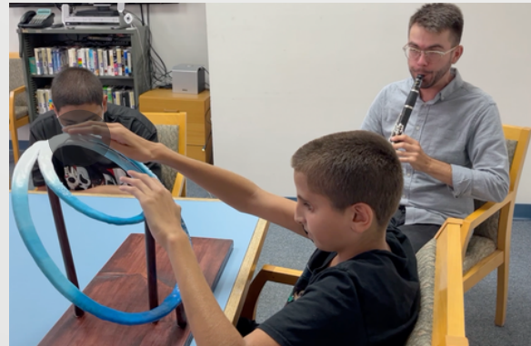
Bubble Net Feeding Behavior