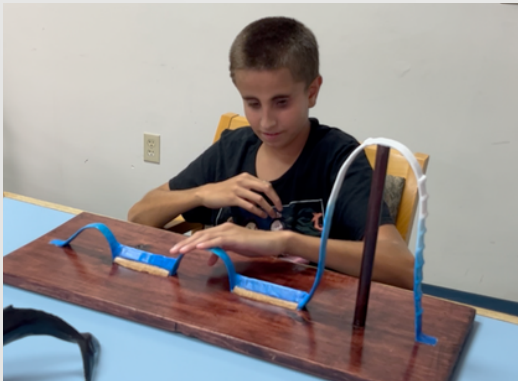
Bottom Side-roll Feeding Behavior