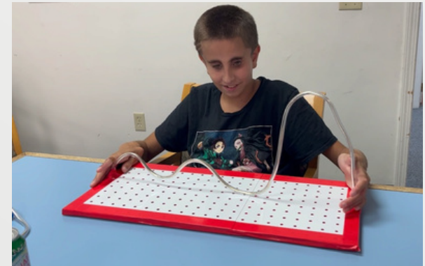
Animal Motion Path Maker

Learn more about this project at www.soundexplorations.org