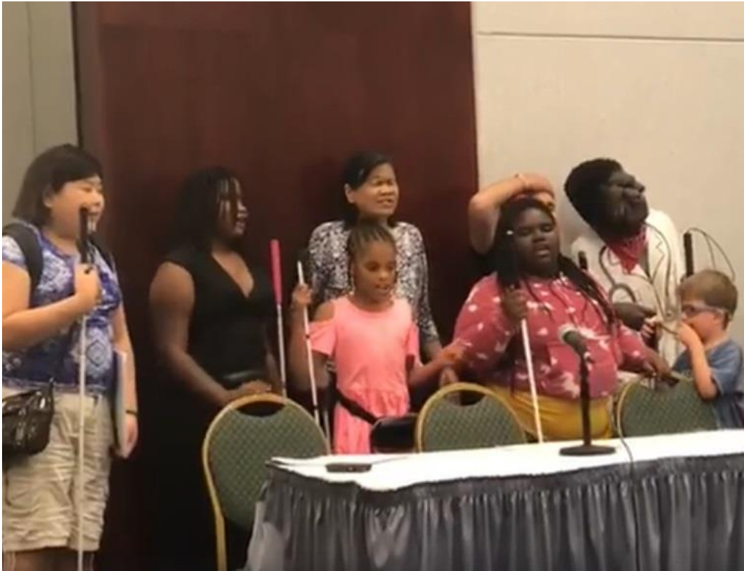
Image: NFB BELL Academy participants singing our original BELL song