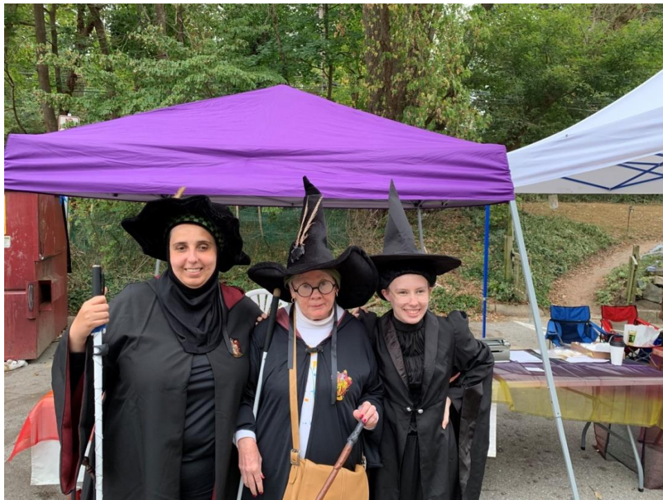
Image: Participants dressed in costume for the NFB Meet the Blind Month Wizinging Weekend on Main in Old Ellicott City