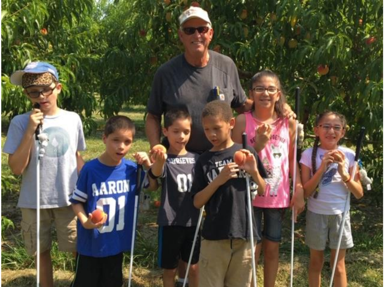
Image: BELL participants picked peaches and later assembled peach baskets for blind seniors