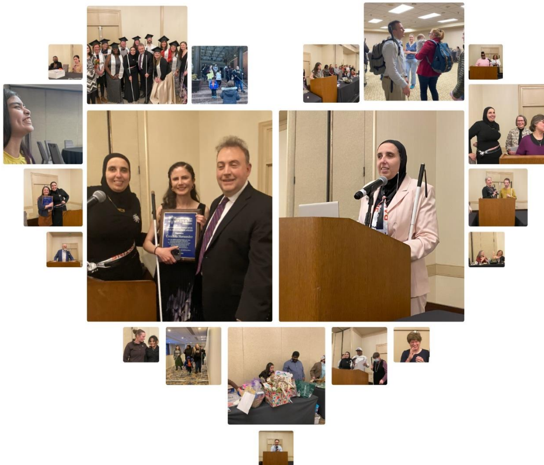
Image description: Twenty photos from state convention are laid out in various sizes to form a heart — various NFBMD members and leaders smile and laugh together, present at podium, receive awards, manage door prize table, and participate in cane walk.

Thursday, February 13 to Sunday, February 16