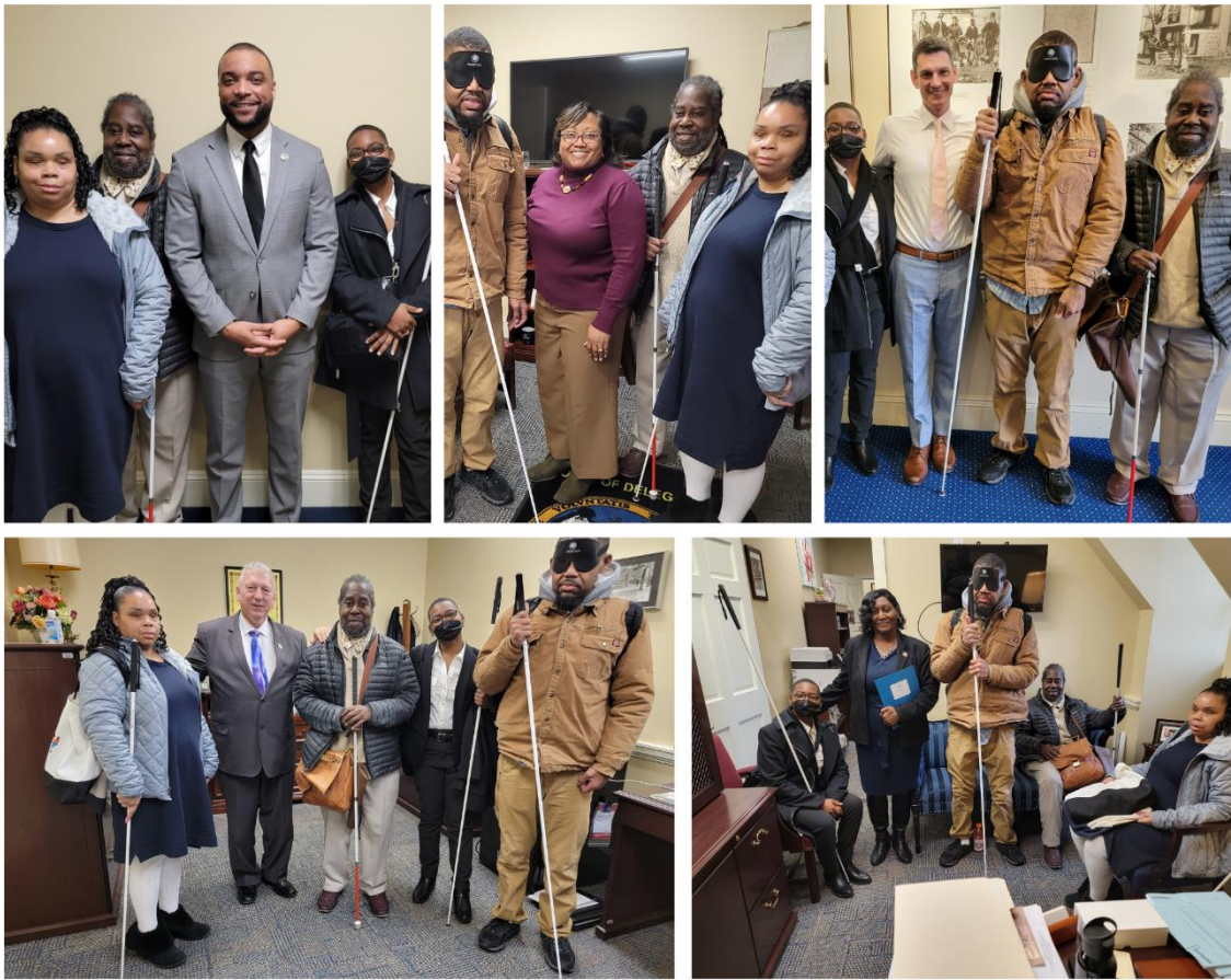
Images: NFBMD members meet with five different congressional representatives at the 2024 NFB Washington Seminar.