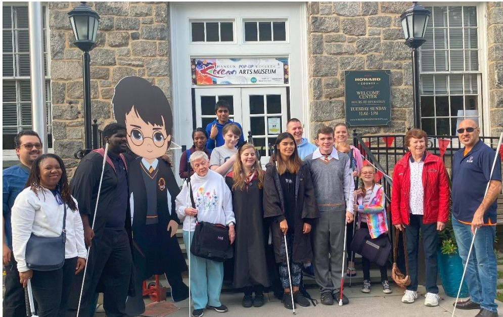
Image: NFBMD members host Wizarding Weekend on Magical Main in Old Ellicott City to commemorate Blind Equality Achievement Month and White Cane Awareness Day.