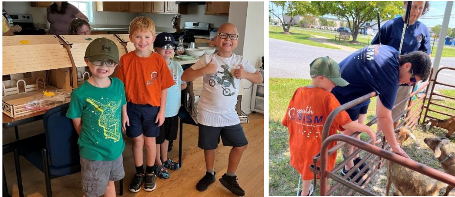
Eastern Shore Images: NFB BELL students smile with 3D model barns behind them (left). Student with two adults at petting zoo (right).