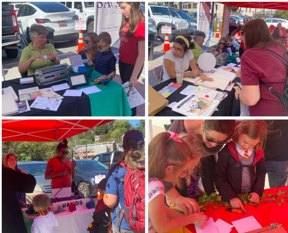
Images: NFBMD members exhibit activities during Wizarding Weekend: Brailleing names, showing tactile books, decorating wands, and Brailleing more names.