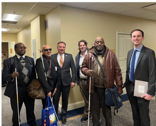
Image: NFBMD members smiling with different MD House of Delegates and Staff at Day in Annapolis