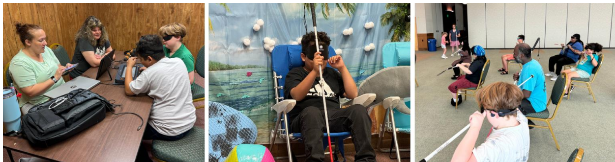
Baltimore Images: Two teachers teach NFB BELL students chess on Monarch (left). At BELL beach, blind student sits on beach chair in front of beach backdrop surrounded by beach ball and surf board (center). Kids and staff wearing learning shades do a cane workout while seated on chairs (right).