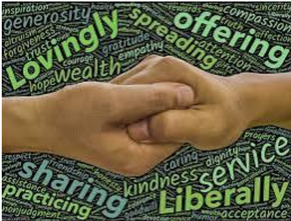
Image description: Two hands grasping the fingers of one another, surrounded by a word collage including the words: generosity, lovingly, trust, spreading, offering, compassion, sharing, practicing, kindness, dignity, service, acceptance, and nonjudgement.

Friday, February 16 to Sunday, February 18