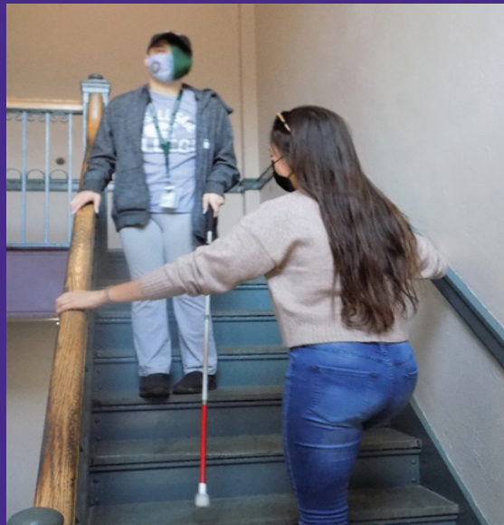
An OMA is in front of a participant while the participant descends stairs with a long cane.

Orientation and Mobility Assistants (OMAs) work under the supervision of an Orientation and Mobility Specialist, to teach a wide array of skills to individuals who are blind or visually impaired.