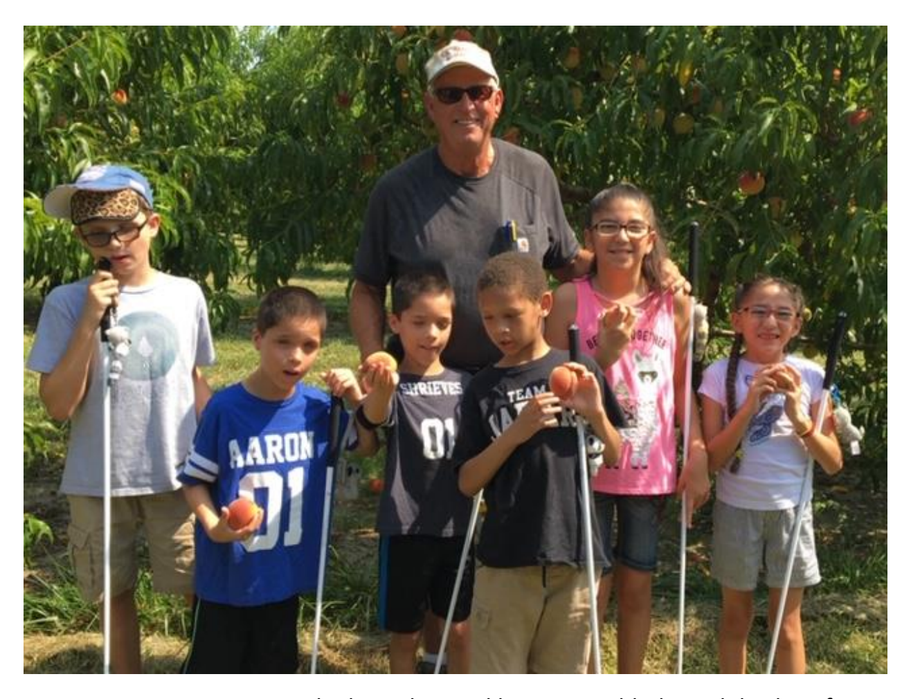
Image: BELL participants picked peaches and later assembled peach baskets for blind seniors