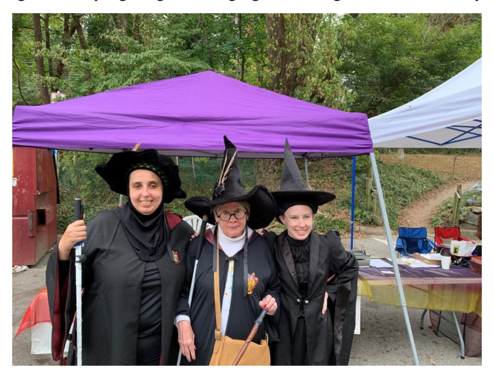
Image: Participants dressed in costume for the NFB Meet the Blind Month Wizarding Weekend on Main in Old Ellicott City