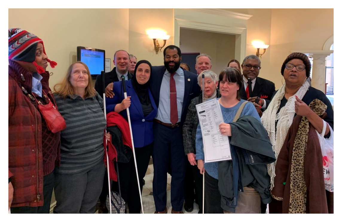
Image: NFBMD engaged in legislative advocacy in Annapolis with Delegate Mosby fighting for desegregated voting based on disability