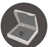
Soiled Paper Items