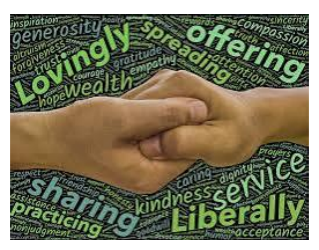
Image description: Two hands grasping the fingers of one another, surrounded by a word collage including the words: generosity, lovingly, trust, spreading, offering, compassion, sharing, practicing, kindness, dignity, service, acceptance, and nonjudgement.

Friday, February 16 to Sunday, February 18