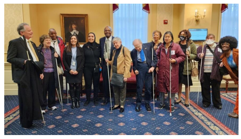
Image: NFBMD members stand with sponsor Senator Benjamin Brooks at Senate Accessible Electronic Ballot Return Voting bill hearing