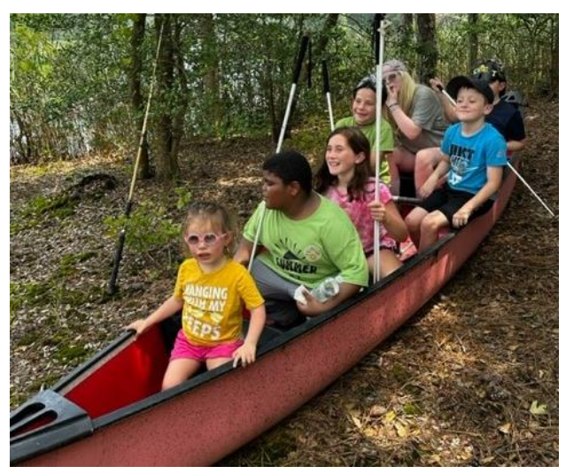
Image: NFB BELL Academy students in Southern Maryland sit in a canoe