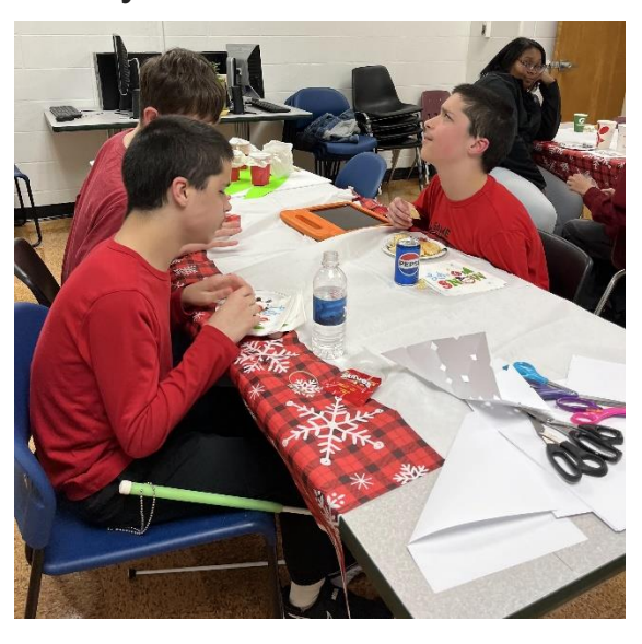
Image: NFB BELLX Academy students in Salisbury attend a holiday party.