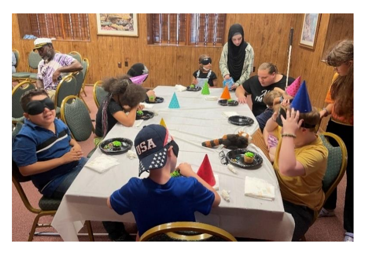
Image: NFB BELL Academy students in Baltimore celebrate Louis Braille's birthday