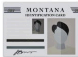
Montana ID Card