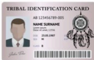
Tribal Photo ID Card