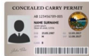
Concealed Carry Permit