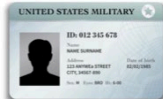
Military ID Card