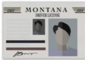
Montana Driver's License