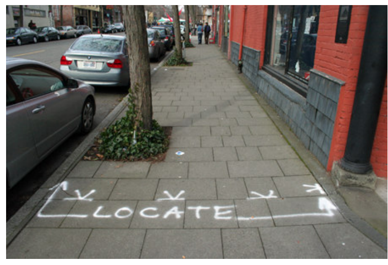
Ballard sidewalk repair