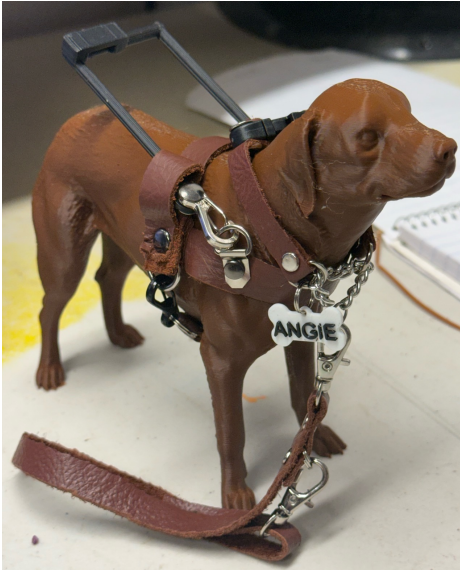
Presents 3D printed Guide Dog model with accessories