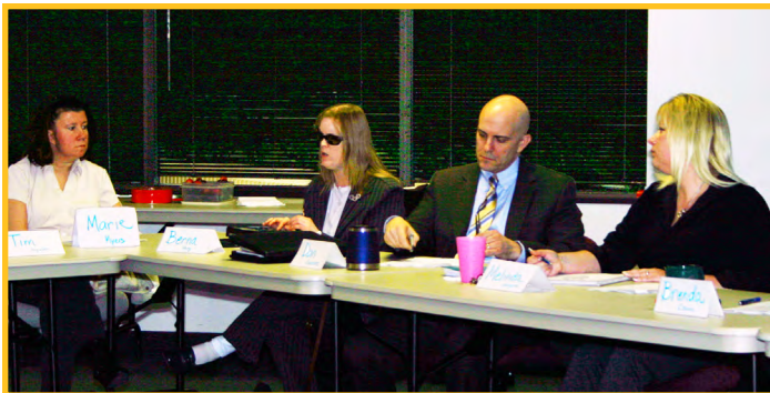
VR DAG discuss issues with executive team

The VR DAG reports recommending that we go about building a culture of trust. Building is the key word, as this is not a restoration process but the manifestation of events that span the shifting priorities of three administrations. VR counselors report a perception that they are not trusted, based on administrative policy on documentation of