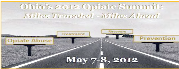
Opiate Summit - May 7-8, 2012

RSC is teaming up with our Recovery-2-Work partners at the Ohio Association of County Behavioral Health Authorities and the Ohio Department of Alcohol and Drug Addiction Services on another Opiate Summit to be held May 7 and 8. We've come a long way in miles traveled since our first Opiate Summit announcing the Recovery-2-Work program. We want the local officials battling the Opiate epidemic to get a good grasp on the efforts of the last year and the issues that are still to be solved as we all acknowledge there are many miles ahead in the battle against Opiate addictions.