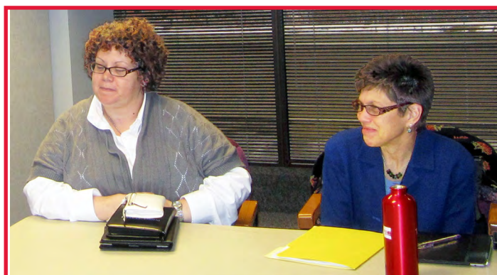
IPE to IPE program partners including Project SEARCH

training across the state. RSC currently serves 2,929 consumers making the transition from school to work.