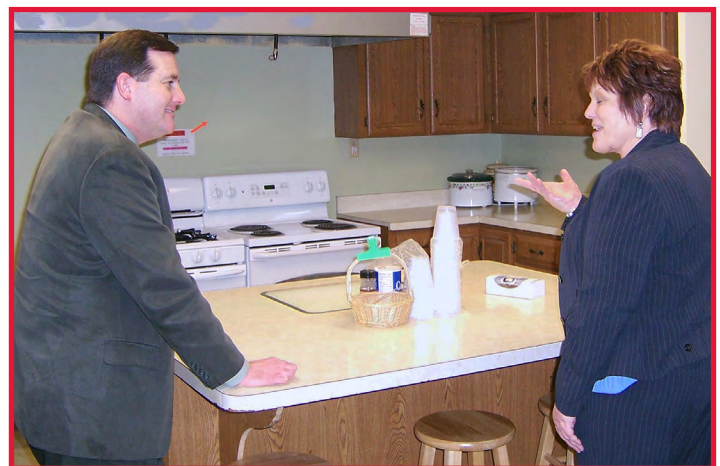
Discussing issues at the Society for Equal Access in New Philadelphia

Transportation: In Akron or New Philadelphia, transportation is an enduring obstacle to employment, health care and participation in the community for people with disabilities. The Society for Equal Access showed us a sophisticated fleet management and maintenance system to keep the wheels turning on their vans that average more than 300,000 miles of service, transporting consumers to jobs or medical appointments from 6 am to 10 pm every weekday, with medical runs continuing during the weekend.