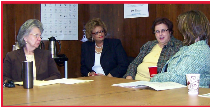
Meeting with the Tri-County Independent Living Center in Akron

Housing, Health Care & Hunger: The CILs serve a clientele that is usually living on fixed incomes that are very often stretched beyond the breaking point by the expense of housing and health care. The result is a new problem for the Tri-County Independent Living Center where counselors now need to know how their