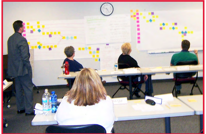
The Kaizen Fiscal Team study the process.

The current process is certainly complex as there are 75 steps, requiring 14 decisions and 24 handoffs before an invoice becomes a payment. The Fiscal Kaizen team has eliminated 57 elements of this process, while also