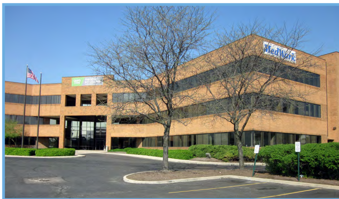
RSC's new Dayton office

We have shaved $1.2 million from annual operating costs at RSC by downsizing some of our field offices and embedding some of our counselors into other government buildings. Dayton is a good example as we have moved from nearly 15,000 square feet of office space to under 12,000 square feet, saving us $30,720 per year. Our executive team visited the new Dayton office to see how our colleagues are adjusting to their new space. Some of us were also able to attend the Dayton office open house last week, where the new Cincinnati Street location was shown to consumers and partners.