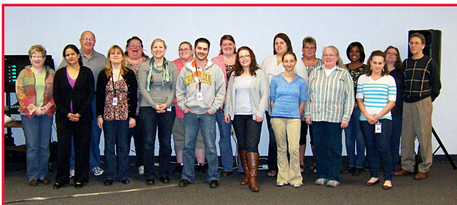
New VR Staff Training Graduates

Fee Schedule: The results of the current research comes to RSC at the end of May and then goes to the Joint Committee on Agency on Rule Review, (JCARR) for approval.