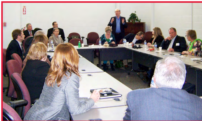
A representative from the Netherlands delegation addresses the audience.