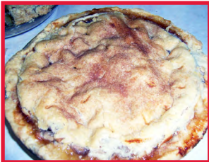
Homemade Apple Pie

The RSC Executive Leadership Team started the week with an early morning drive to the Northwest corner of the state. We met with Defiance staff at the Fulton County Job Center One-Stop in Wauseon. This is the section of Ohio where the borders of Michigan and Indiana are both nearby.