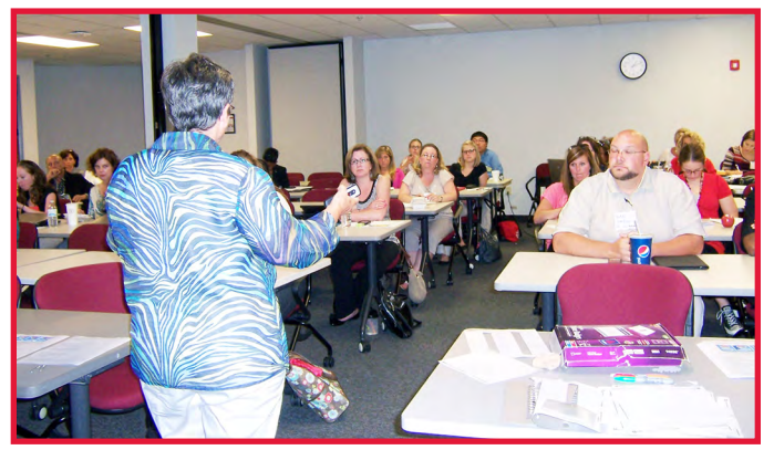
Over 50 new Project SEARCH partners attended training at RSC.

Over fifty new Project SEARCH partners gathered Monday and Tuesday for training on the Project SEARCH model of high school transition for young people with intellectual and developmental disabilities. The training