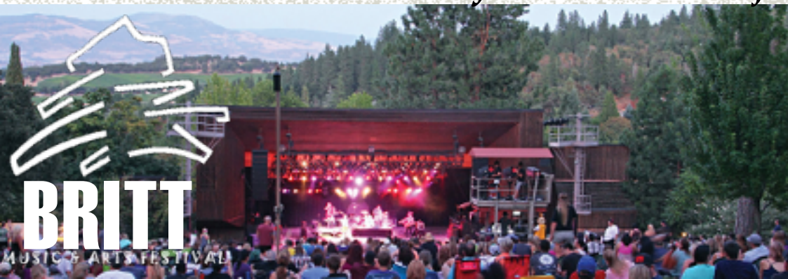
BRITT MUSIC & ARTS FESTIVAL